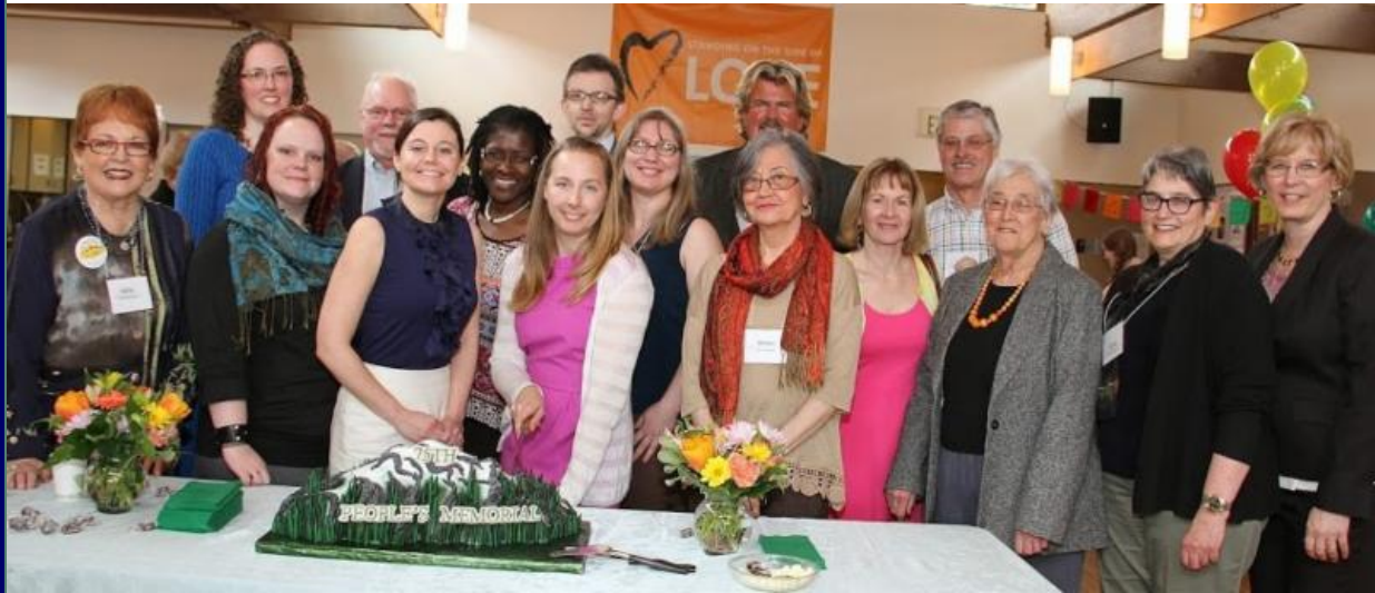
PM Board & Staff, 2014